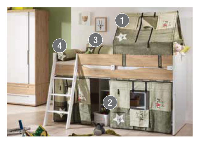
Design: Canvas Style