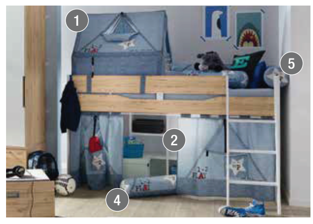
Design: Jeans Style